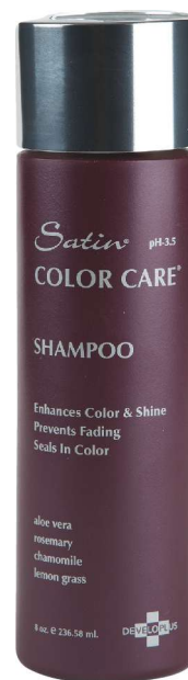
Developus Satin Color Care Shampoo satinhaircolor.com