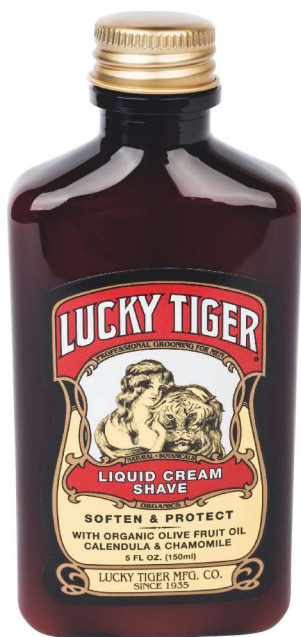
Lucky Tiger Lucky Tiger Liquid Cream Shave 800.222.8160, getluckytiger.com