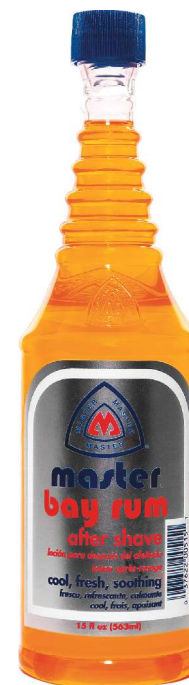
Master Well Comb Master Bay Rum After Shave 800.343.4989, masterwellcomb.com ■