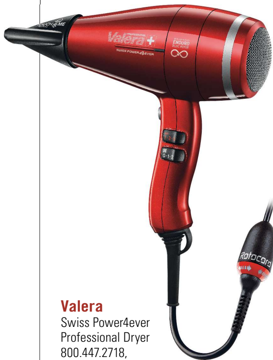
Valera Swiss Power4ever Professional Dryer 800.447.2718, valerausa.com